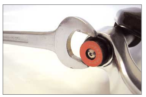
After you have relaxed the pre-load unit of the spring you can turn off the entire unit.

Gently turn the adjustment knob for the preload on the adjustment unit (9) clockwise as far as it will go. This causes the spring to relax.